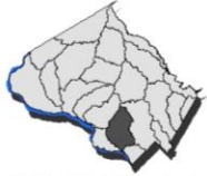
Cabin John Watershed

Metadata Date: January 2010 Description: Stream resource conditions represent the average of baseline station scores within each watershed or tributary polygon. There may be more than one monitoring station within each watershed or tributary polygon. Stream resource conditions within Special Protection Areas (SPAs) are not averages, but rather are the most recent stream condition scores based on the drainage areas to the specific SPA monitoring sites. Contact: Jennifer St. John - jennifer.stjohn@montgomerycountymd.gov For stream monitoring program questions: Keith Van Ness, Senior Water Quality Specialist keith.van Ness@montgomerycountymd.gov